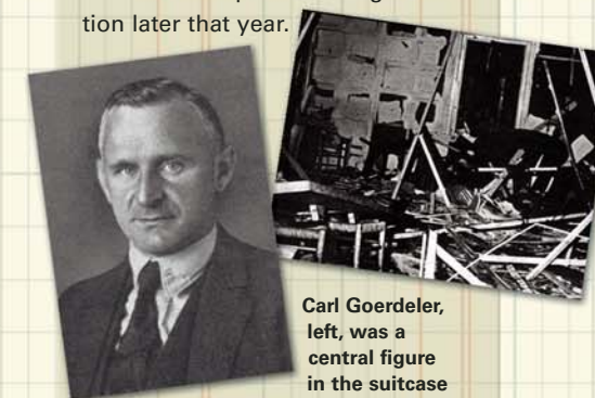
Carl Goerdeler, left, was a central figure in the suitcase bomb assassination attempt on Hitler, July 20, 1944, in East Prussia, Germany.